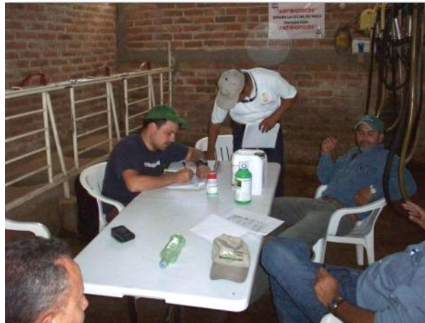
Fig. 2. Data collection on a Mexican dairy farm. The farmer interview usually takes three to four hours. It is the main source of information for the RISE analysis.

Data are entered online or offline into the RISE software, or recorded on a paper questionnaire and entered in the office. Data collection covers agricultural production at farm level during one year (calendar or agricultural year). For some aspects, this scope of the analysis is extended temporally or spatially to better cover the sphere of impact of agricultural production. Parts of the questionnaire and of the calculation and valuation functions can be adapted to the regional or even the individual context of the farm.