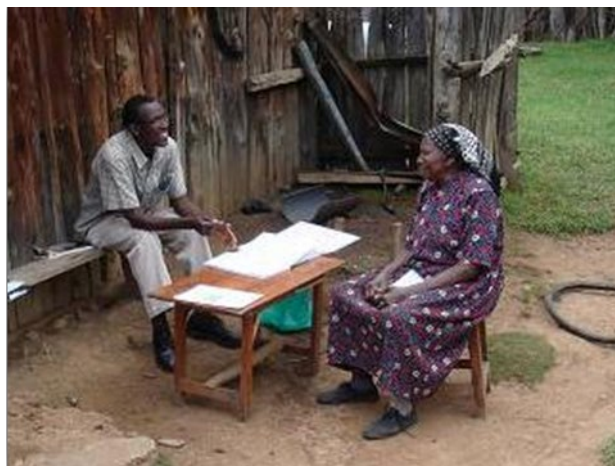
Fig. 5. RISE feedback discussion with a farmer in Kenya. Results can also be presented and discussed in group sessions.

In projects, where one or several groups of farms have been analyzed, the summary report contains statistical as well as qualitative analyses across the farm sample. Framework conditions influencing farm performance are identified and discussed. If desired by the client or the farmers, the conclusions can also include recommendations of measures through which performance could be enhanced. These recommendations are discussed with experts for the respective topic (animal health).