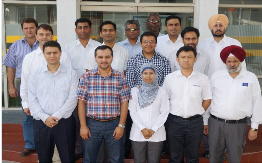
Fig. 1. Participants to a RISE training course in India. RISE trainings are held with groups of 5 to 15 persons and include the hands-on use of RISE on at least one farm.

After the training course, participants receive support by the RISE team at HAFL (or a partner institution) during the first five farm analyses. They are then certified as RISE consultants and can continue to analyze and advise farmers on their own, in the context of a RISE license. There are different licensing models, depending on place, purpose and volume of the intended RISE usage.